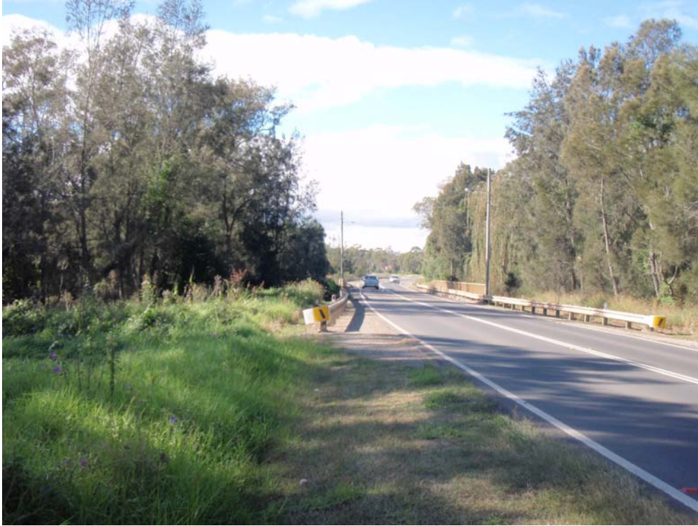
Existing Bringelly Road, Bringelly travelling eastbound