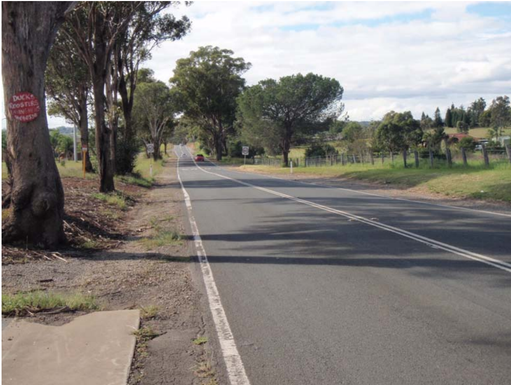
Existing Bringelly Road approaching Kelvin Park Drive travelling eastbound