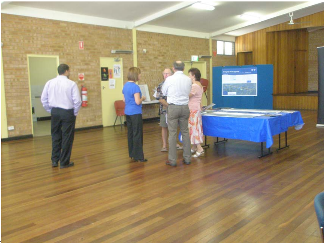
Community information session held on 12 December 2009 at Bringelly Community Centre