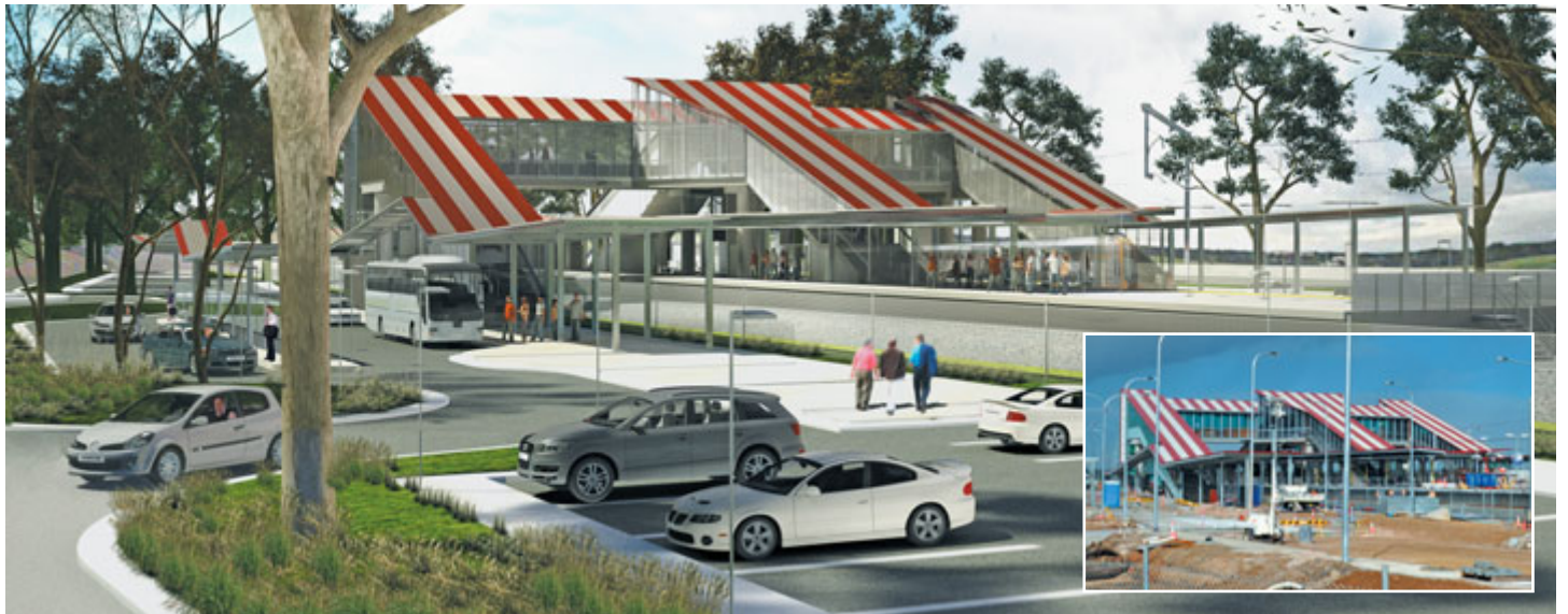
Indicative artist's impression of the new Schofields Station from Railway Terrace. Inset: Photo of Schofields Station under construction as at June 2011.

See inside for pictures, diagrams and more information about your new Schofields Station. More information will be provided to residents and commuters over the coming months.